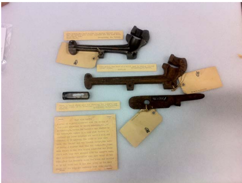
Pipe Molds, National Museum of Country Life, Co. Mayo, Ireland