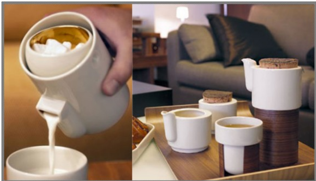
Tonfisk range of Ceramics 2012

I propose that these objects remind us of the value of the hand made. They also remind us of the relationships between craft and industry and somehow still measure the touch of the human hand in a world where that seems no longer valued. We are now seeing in contemporary productive design (TonFisk from Finland for example) where the relationship between the made object and its user is becoming more fully integrated. The objects are multi functional and engage the user in the act of pouring, storing and consuming.