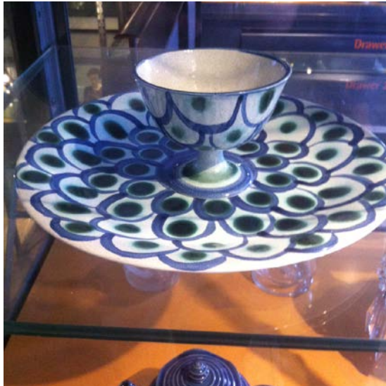
John ffrench plate and single stem bowl, 1969

Let us examine the object: a hand painted dish, with a centrally located single stem bowl which is standing in the centre of the circular dish. Loops of cobalt blue colour decorate the under glazed surface with spots of copper green within the loops.