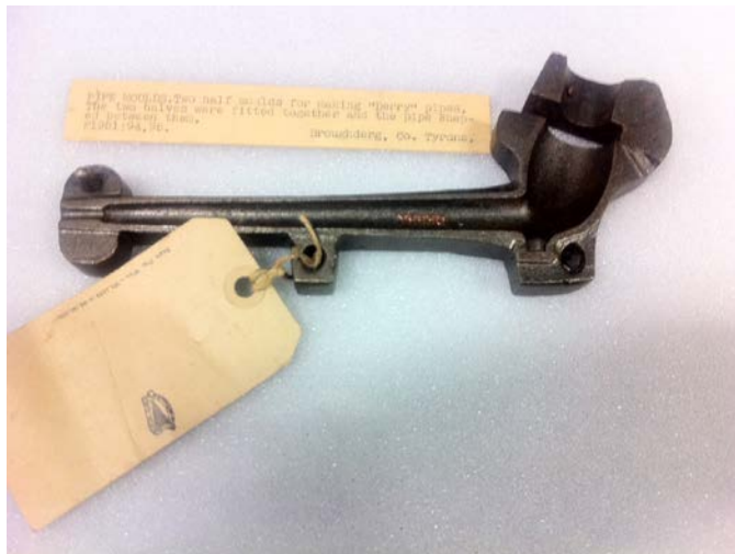
Pipe Molds, National Museum of Country Life, Co. Mayo, Ireland

always be drawn to. It is human nature to make, create and leave a mark, an impression in clay or a foot print in sand.