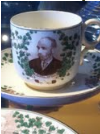
Stoke on Trent Teacup and Saucer

Also in the range of tableware are other characters of historical and political significance. Michael Davitt (1846-1906) also appears in the same format as Parnell. Davitt, a republican and nationalist activist is reflected in the portrait form, with a gaze to his left. The clasped hands of a handshake agreement also appear below his portrait.