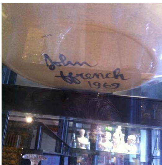
John ffrench signature 1969

3 http://www.legacy.com/obituaries/berkshire/obituary.aspx?n=john-ffrench&pid=138954803#fbLoggedOut