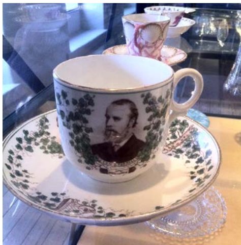
Stoke on Trent Teacup and Saucer

One example from the range is the Charles Stewart Parnell teacup. Parnell (1846-81) was an Irish Nationalist, a political leader and a land reform activist. The teacup and saucer are standard slip cast saucer and handled cup of generic aesthetic for the period, its proportions and finishing are refined. Broadly over both cup and saucer are wreaths of Shamrock, a symbol of Ireland, used by St. Patrick to define the Catholic Holy Trinity of Father, Son and Holy Ghost.