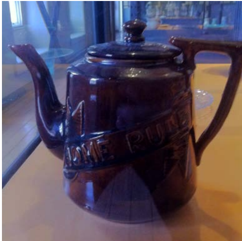
Home Rule Teapot 1888

Testament to political initiative is not the only hidden attribute the craft object can imbue. Consider the 'Home Rule' teapot.