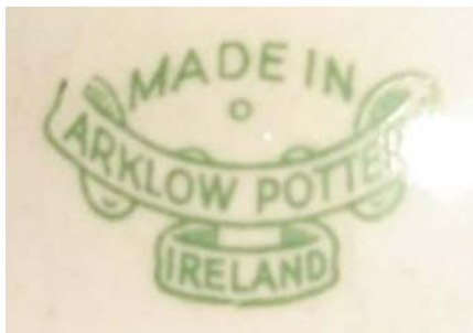
Arklow Studio Pottery Stamp