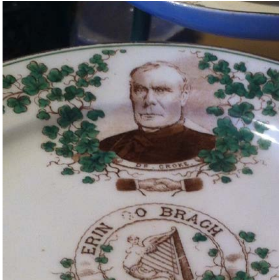
Stoke on Trent Plate

and http://en.wikipedia.org/wiki/Hiberno-Roman_relations