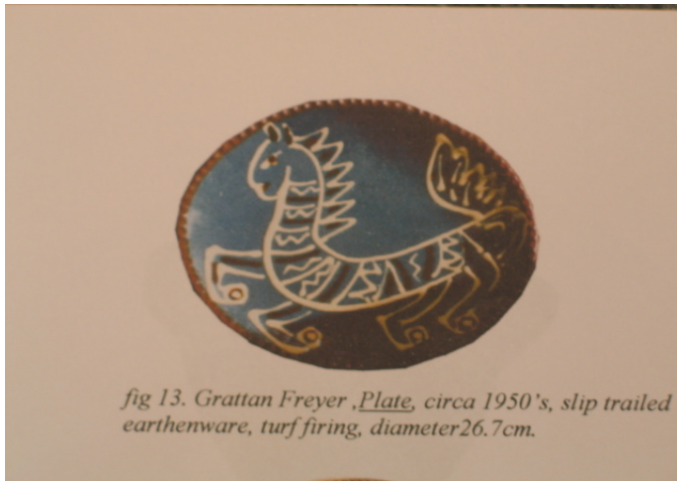
Gratten Freyer Ceramics