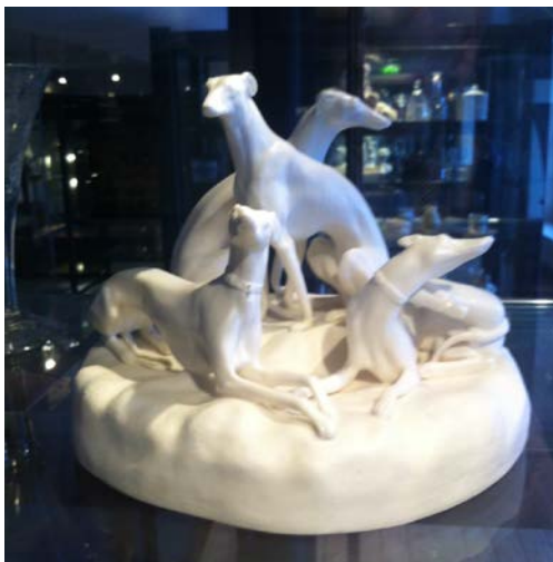
Greyhounds, Belleek Pottery, 1870.

Moving away from the political and emancipatory nature of aforementioned objects, reports and events, let us consider a discreet porcelain object, namely a collection of dogs, greyhounds, calmly idling in anticipation of future activity.