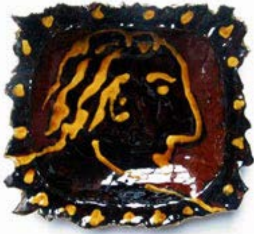
Cormac Boydell Plate 2013